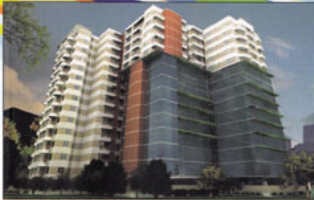
FARE DIYA AT PANTHPATH